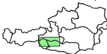
Figure 1: Sketch of Austria with the study area

The area of the Hohe Tauern mountains is a region in the Austrian Alps, which is still left largely in its natural state. It encompasses the Hohe Tauern National Park and includes parts of the federal states of Tyrol, Salzburg and Carinthia (Fig. 1). But even in this remote area, some of the larger vertebrates were extirpated by man, among them the otter. Today the question is being considered of whether to enable these former inhabitants to return, and furthermore, how this could be done. As reintroductions of bearded vulture ( Gypaetus barbatus ) and ibex ( Capra ibex ) have been very successful, discussions about the otter as a potential candidate have arisen.