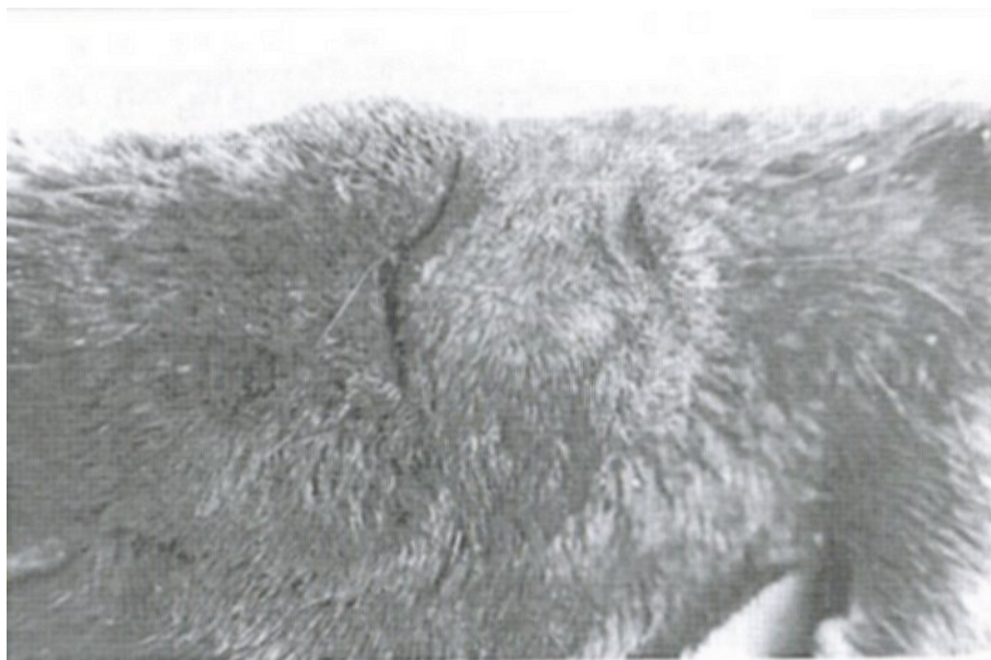
Figure 2: Close-up picture of the nose of the skin of Hairy-nosed otter (Skin 1) found on 4 March 2000, in a farmer's house situated just 200m outside the Core Zone of U Minh Thuong showing densely haired rhinarium (click image for close-up)

Skin 2 was found on 7 March 2000 in a farmer's house, who reported that he caught the otter in March 1999 just inside the Reserve's Core Zone. Hairs on the rhinarium of this skin were partly destroyed by insects but can be clearly recognised. Its outer appearance and measurements (Table 2) are very similar to skin 1.