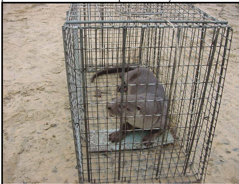
Figure 2. Lontra longicaudis captured in a live trap.

After this period, the signal emitted by the transmitter stopped varying; leading us to suppose that the otter was dead or it had removed the equipment with the transmitter. For about 5 days the signal was traced and finally the radio-transmitter was found in perfect condition inside a burrow on the coast of the estuary on a nearby island (Comprida Island). The hypothesis that the otter had removed its own collar is based on the fact that did not find signs of blood or struggle at the place or on the collar and it was still closed, excluding the possibility that the animal had been predated upon or that hunters had removed the collar. This hypothesis was confirmed 12 days after the radio-transmitter had been found when the male was seen feeding itself peacefully at 07:20 pm on the beach 300 m far from the burrow where we found the transmitter. Identification was possible due to the fact that we had shaved a small part of its side at the moment of capture to identify it in case it removed the collar.