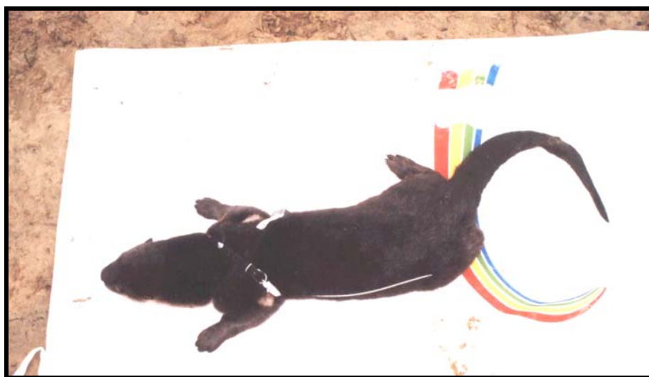
Figure 3. Lontra longicaudis with the radio-transmitter adapted on two collars.

In spite of the little time that the otter stayed with the radio-transmitter, the data obtained are of relevant importance because they show an unknown activity pattern; besides showing, over a short period, some pattern of use of burrows.