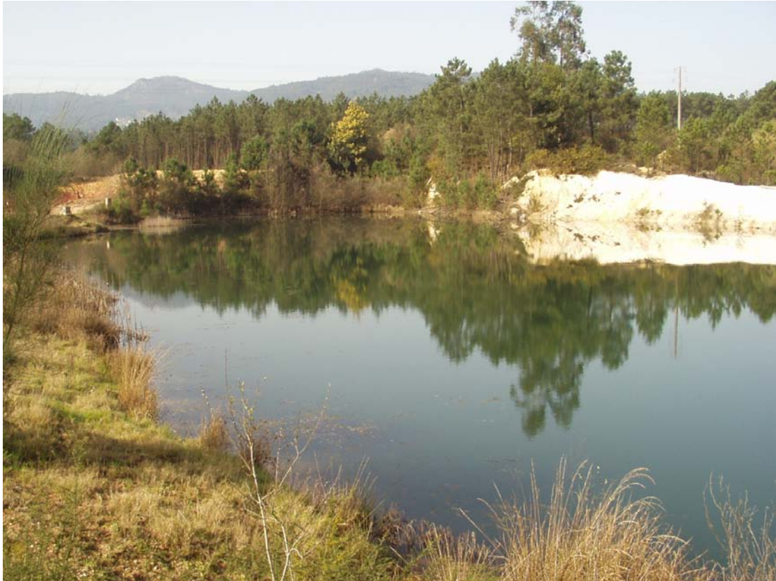
Figure 2. Partially naturalized clay pit.