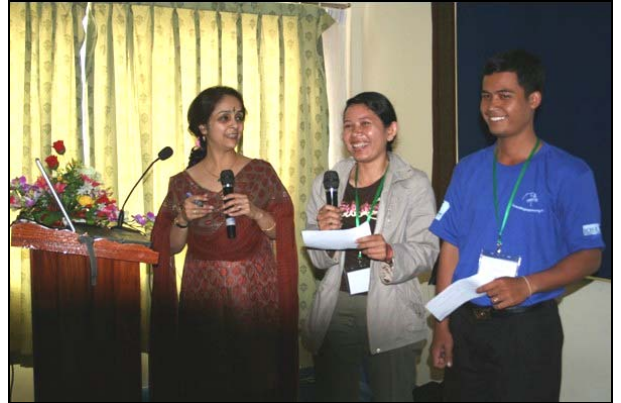
Figure 11: Student presentation