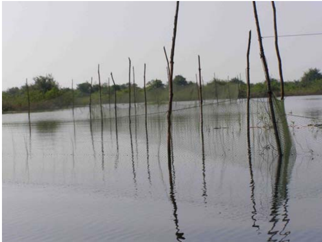
Figure 32: Fishing is their main livelihood