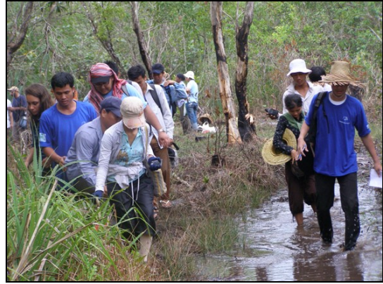
Figure 18: Walking through the boggy water to place the camera trap