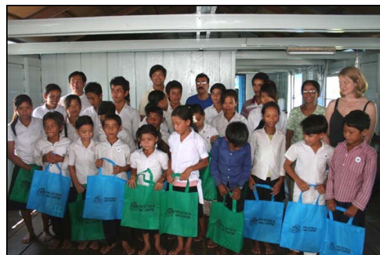
Figure 31: ... and get prizes