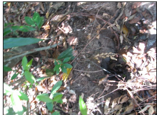
Figure 16: Smooth-coated otter den