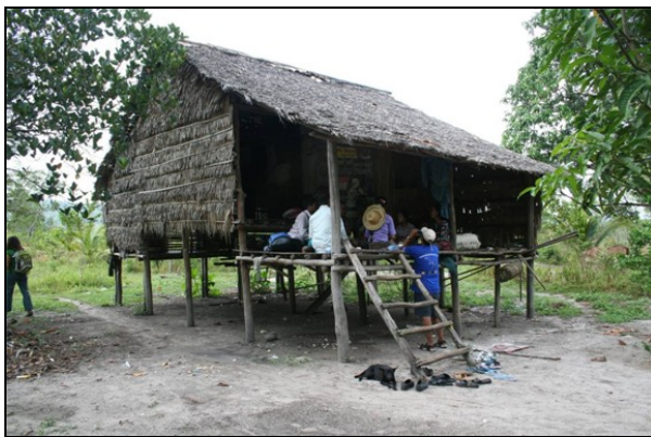
Figure 12: The family home of the village elder

More class room based activities covering how to do an otter survey, and social surveys with role play practice. We covered how to use GPS, map reading, and field safety. Then after lunch off the field site, to the river Tatai Krom where we went down stream in small boats to interview an indigenous family (Figures 12 and 13) to do initial field observations, and to put into practice what had been learnt in the classroom (Figure 14). We were divided into small groups supervised by a trainer. We all recorded our data, and we presented the results to the group on the last day. We were practicing how to carry out a survey, record, analyze and present data.