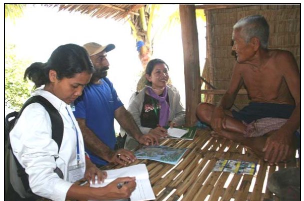
Figure 13: Talking to the village elder