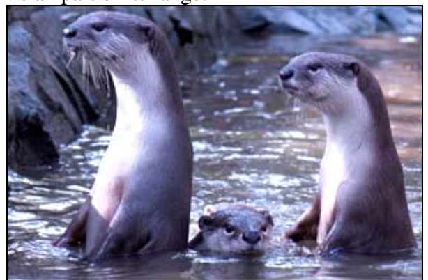
Figure 2: Smooth-coated otter