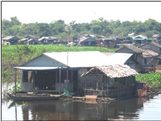
Figure 26: The village