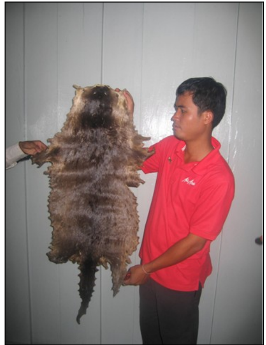
Figure 33: Pelt of a hairy-nosed otter found in nets in December 2008