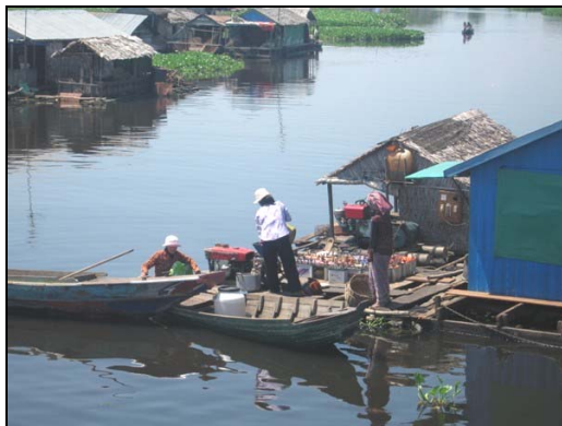
Figure 28: Making fish paste