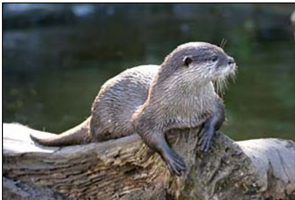
Figure 3: Asian small-clawed otter