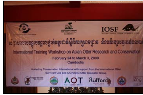
Figure 6: Workshop opening with Government officials Figure 7: Workshop banner