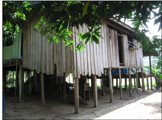
Figure 22: We are given food and shelter with the family who live here