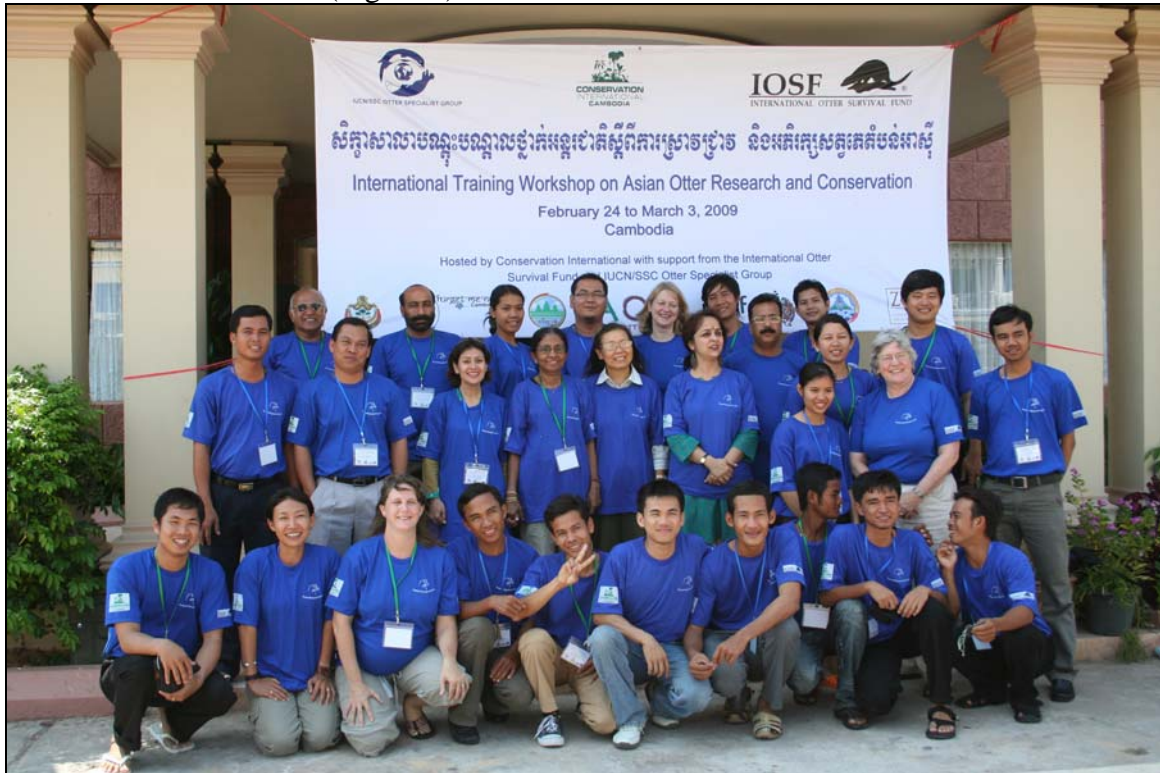
Figure 5: All participants in the workshop

knowledge in Cambodian university students and government staff, as well as international researchers (Figure 5).