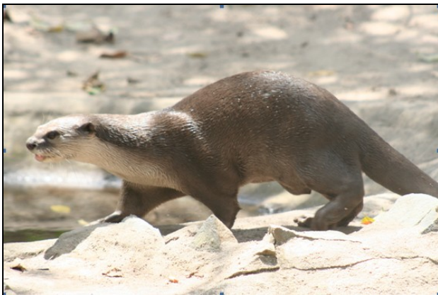
Figure 15: Smooth-coated otter

Back to the field but further downstream to practice camera trapping, smooth-coated otter tracks and signs practical, surveying and habitat assessment (Figures 15 – 21). A lot of hands-on experience today – well, feet in mud anyway! We were given lunch here, cooked by the local family, and we all ate in their house and dried off after we got totally soaked in the morning (Figure 22).