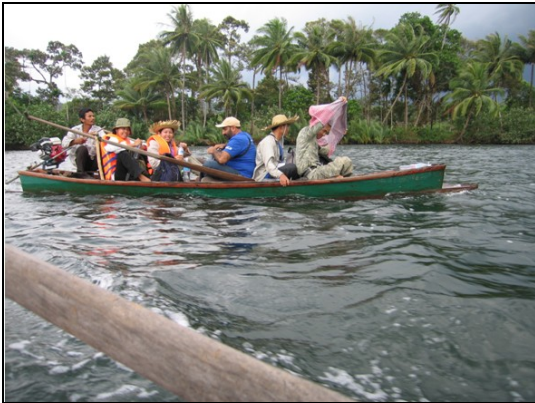
Figure 21: The storm arrives