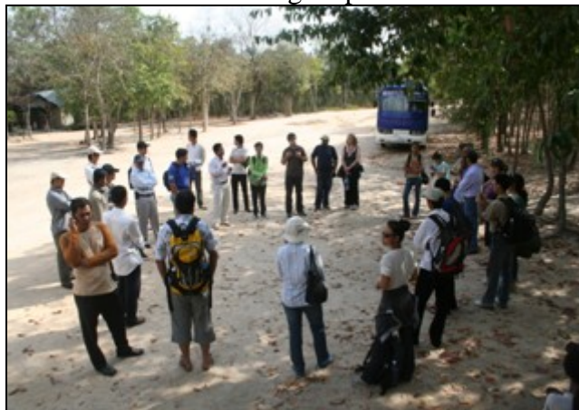
Figure 9: Phnom Tamao Rescue Centre

We visit the otter enclosures, and some of the other rare, captive wildlife there, some of which will be released. There is a strong emphasis here on rehabilitation.