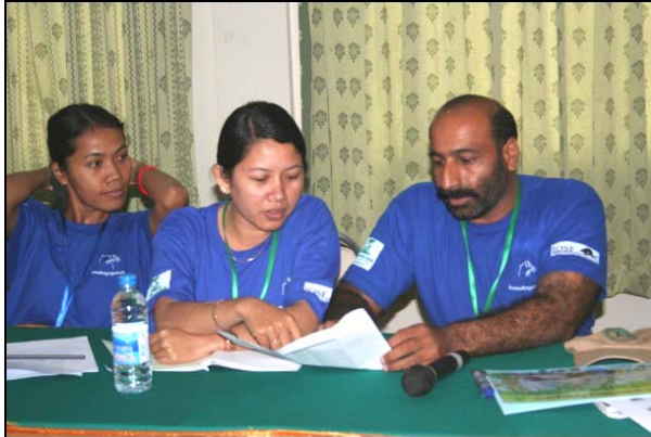
Figure 10: Classroom discussion

(research questions, methods, and site selection), sprint analysis, and finishing with the student presentations (Figures 10 and 11). In the evening the students became the tutors, and had much fun as we learnt Cambodian dancing.