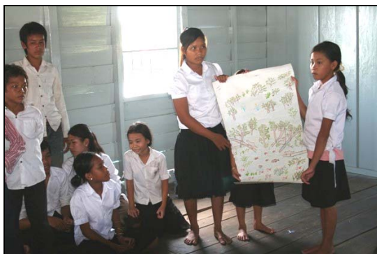
Figure 30: They give presentations ...