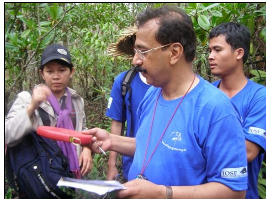
Figure 20: Positioning the site