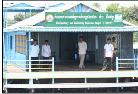
Figure 25: CI's research boat on Tonle Sap