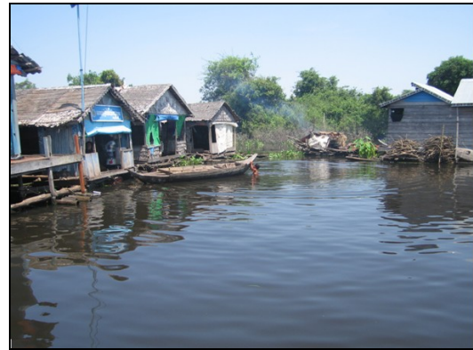
Figure 27: Typical village homes