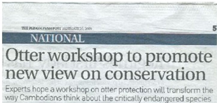
Figure 34: Article in Phnom Penh Post

Student presentations and projects, student tests, and otter Olympics. Presentation of certificates, and dinner in the evening with sad goodbyes.