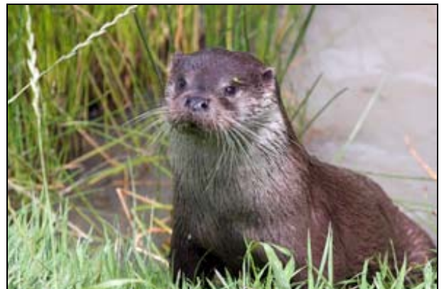
Figure 4: Eurasian otter

The local understanding of the importance of the conservation of otters is very low in Cambodia. Despite the Forestry Administration listing 2 species on the rare list of nationally protected species, many decision makers and Protected Area managers are unaware of the global importance of Cambodia's otter populations. Compared to other 'high status' species, such as tigers and elephants, otters have received little attention. This is mainly due to a lack of funding, research and conservation actions focusing on these species.