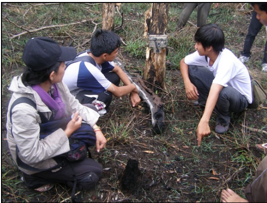
Figure 19: Setting up the camera trap