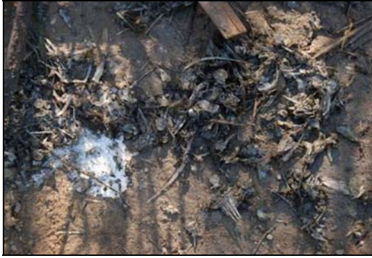
Figure 17: Smooth-coated otter scat