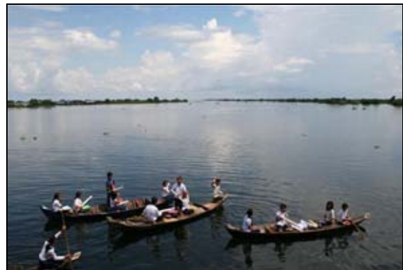
Figure 29: The school children go to school by boat