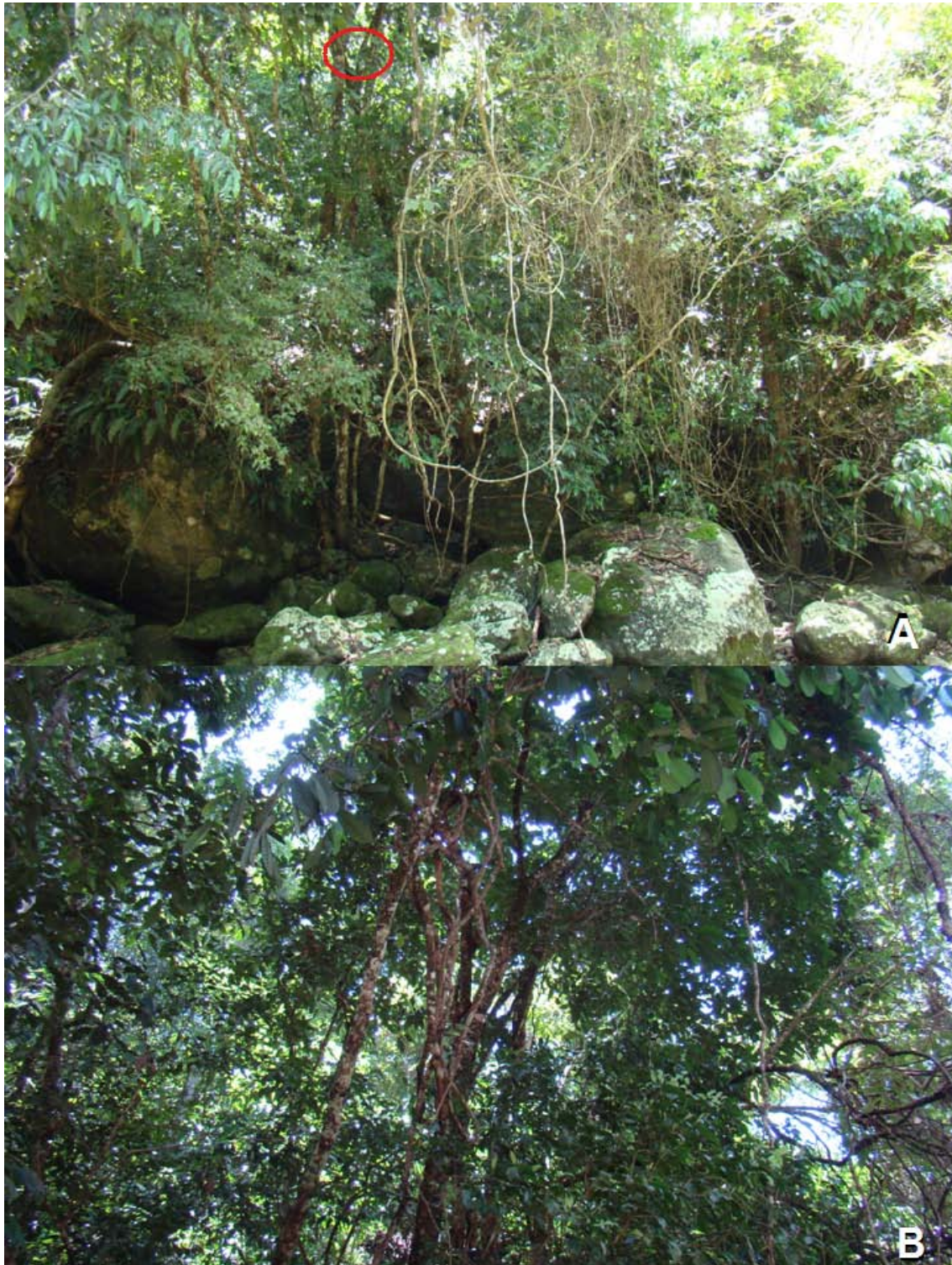
Figure 2. A) Site where the climbing behavior of an individual of Lontra longicaudis was observed in an Atlantic Forest fragment in Private Reserve of Nature Patrimony (RPPN) Usina Maurício, Minas Gerais State, and southeastern Brazil. The circle points to the segment of the trunk corresponding to the maximum height reached by the individual. B) Detail of trunk segment pointed in (A).

Considering factors such as the height achieved by the individual, the high inclination degree of the tree trunk and its small diameter, it is reasonable to assume that L. longicaudis possesses natural climbing abilities, and the behavior reported here may occur frequently in nature. However, since the Neotropical river otter is rarely