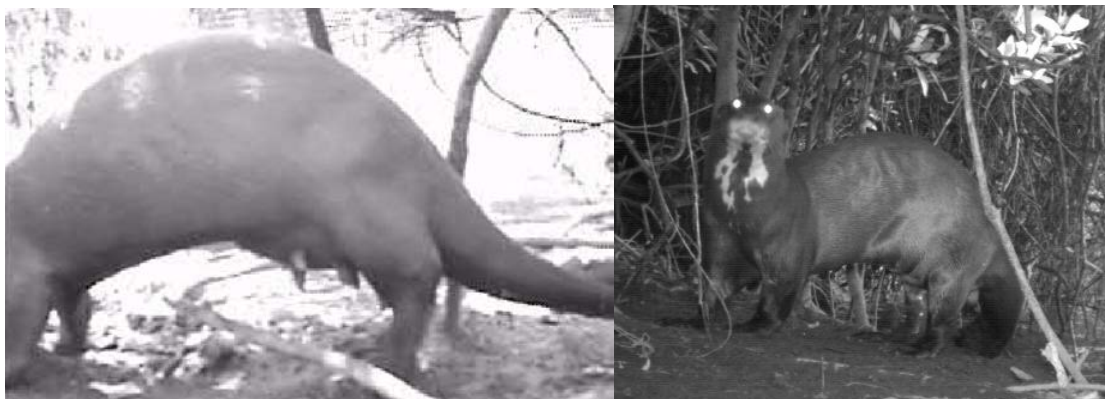
Figure 3. Lactating female with a full udder and enlarged teats (left) and male with visible scrotum (right)

Camera trap images enabled the identification of the reproductive pair for three packs and identification of the breeding female for the fourth. Objective sexing of individuals is extremely important when considering pack social dynamics. While males tend to be heavier than females with thicker necks and broader heads (Duplaix, 1980; Sykes-Gatz, 2005), the variation within each sex means that this rule cannot be relied on for accurate sex determination. Visible genitalia in camera trap images provide a more objective method. However we found that males can often be misidentified, as a protruding anal gland from an otter can often resemble testes. Similarly, a cautionary note must be made regarding lactation. It can be easy to mistakenly assume the presence of multiple lactating females in a pack when two females with visible teats are seen. However, once a female has been suckled, her teats will remain long and visible years after the event (Sykes-Gatz, 2005; Groenendijk, pers. comm.). The lactating female often has more obvious turgid teats (Fig. 3).