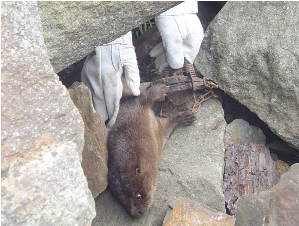
Figure 1. Male marine otter ( Lontra felina ) trapped with a # 1.5 soft catch leg-hold trap in Colcura, VIII Region, Chile. Physical immobilization with the use of leather gloves is performed in order to administrate a combination of ketamine and medetomidine i.m. by hand syringe.

(two males and one female) died within three and six days after capture. One of these otters did not accept any food offered, while the others ate only partial rations. On the day of death all otters (two kept simultaneously), developed an acute, black and smelly diarrhoea. At the post-mortem examination, it was diagnosed an ulcerative gastritis, acute in the two males and moderate in the female (Table 1). Citrobacter freundii and Citrobacter sp. were possible to isolate from the gastric content of the two most affected otters.