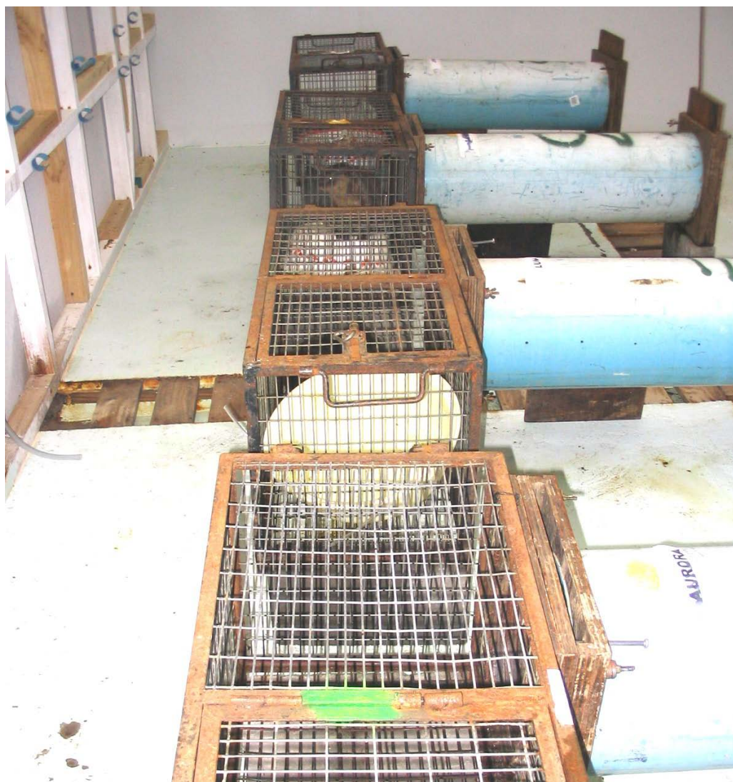
Figure 2. Captive marine otters ( Lontra felina ) individually housed in a quarantine room at the Quintay Marine Research Centre, Universidad Andres Bello.