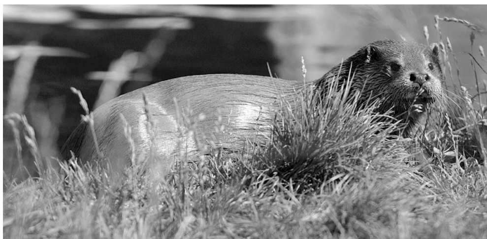
Eurasian otter

3 Muséum des Sciences Naturelles, 6 rue Marcel Proust, 45000 Orléans, France