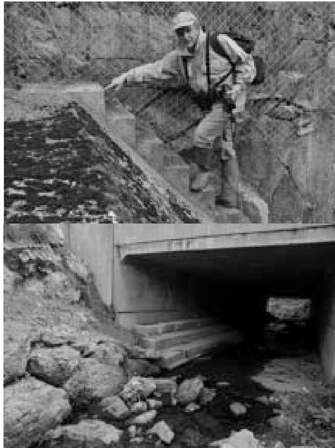
Figure 1. Otter passage over the Queuille Dam on Sioule River and under a bridge over the Alagnon River (steps allowing the passage of animals regardless of the level of water, snow, ice).

corridors used by individuals during territories foraging. Regular monitoring of populations was performed on thousands of miles of riverbanks and highlighted the main obstacles to expanding populations, such as the presence of dams or inadequate road network (Bouchardy, 1986; Bouchardy et al., 2001; Rosoux and Green, 2004; Lemarchand and Bouchardy, 2011). Obstacles were identified by systematic analysis of local crossing by otters, according to the ability of the species and height of dams, local conformation of riverbanks under bridges or near dams (Chanin, 2003a, b; Lemarchand and Bouchardy, 2011). Some of these barriers have been equipped by specific passages, as shown (Fig. 1).