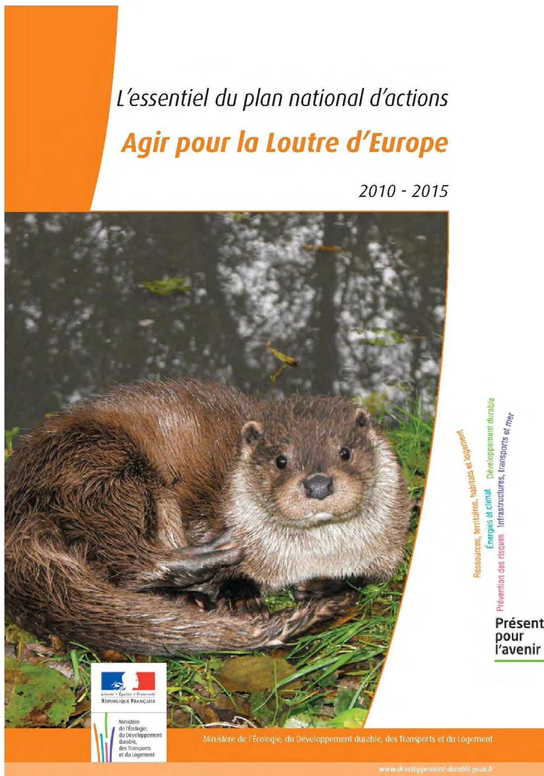
Figure 2. Booklet presenting the Action Plan