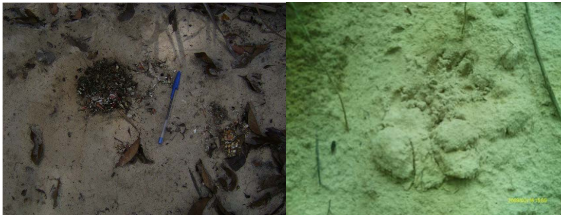
Figure 2: Spraint and footprint of neotropical otters Lontra longicaudis in Quiricó rivers (12°17'52.5"S e 38°09'18.4"W).

because the current data set is too small to permit valuable conclusions from being drawn. Of these live individuals, 61.53% were adults and 38.46% were pups (with evidence of nursing). Neotropical otters are believed to nurse for three to four months and stay with their mother for approximately one year (Nowak, 1991; Parera, 1996). Therefore, the relatively high number of observations of cubs was unexpected, and may reflect the pups' inexperience regarding the dangers of leaving parent care and their curiosity about the environment outside the den. It is also possible that the pups were orphaned or abandoned by their parents. Pups collected from Catu and Almada rivers following floods in the region, suggesting that this may be the case.