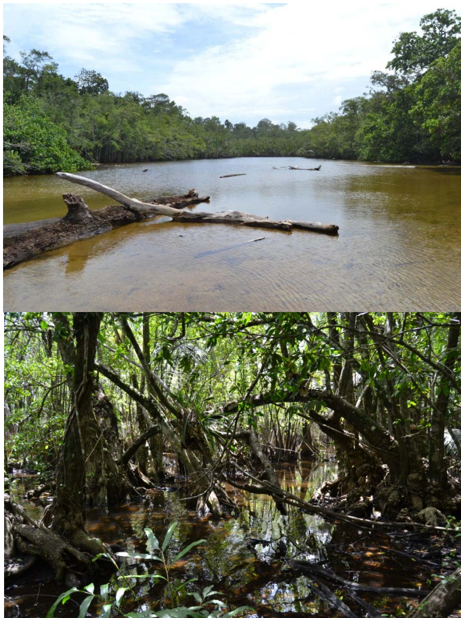
Figure 4. The habitat where the otter was observed (above): the estuary mouth closed by a sand bank and (below) the mangrove swamp further upriver.

The habitat around the estuary is flooded swamp dominated by nypa palm ( Nypa fruticans ) and mangroves ( Bruguiera sp., Avicennia sp.) with banyans ( Ficus microcarpa ) palms ( Pandanus tectorius ) and baringtonia ( Baringtonia asiatica ) also present, consistent with previous observations of L. sumatrana , which have mostly been made in swamps and flooded lowland forest (Wright et al., 2008) (Figure 4).