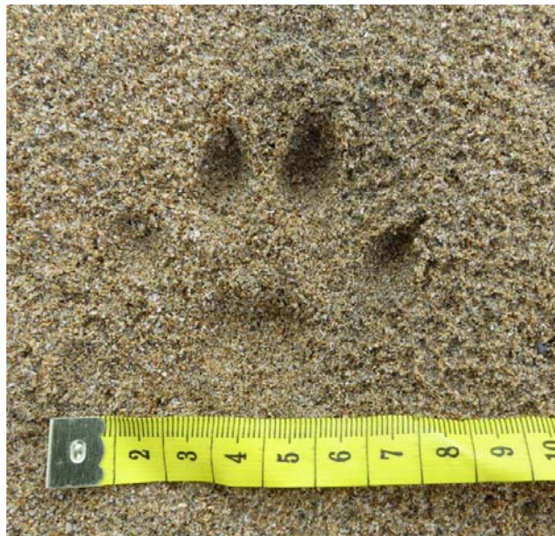
Figure 3. Forefoot print made by L. sumatrana during the observation.

The firm sand did not yield good prints, but one impression of a forepaw had a width of 57mm and a length of 59mm (Figure 3). Only four toes were visible. The largest toe had a width of 10mm and the pad with was 21mm. In the fairly symmetrical print the claws were distinct but the interdigital webbing was not visible. Kanchanasaka (2001) reported average forepaw track widths of 58mm from a sample of 23 observations.