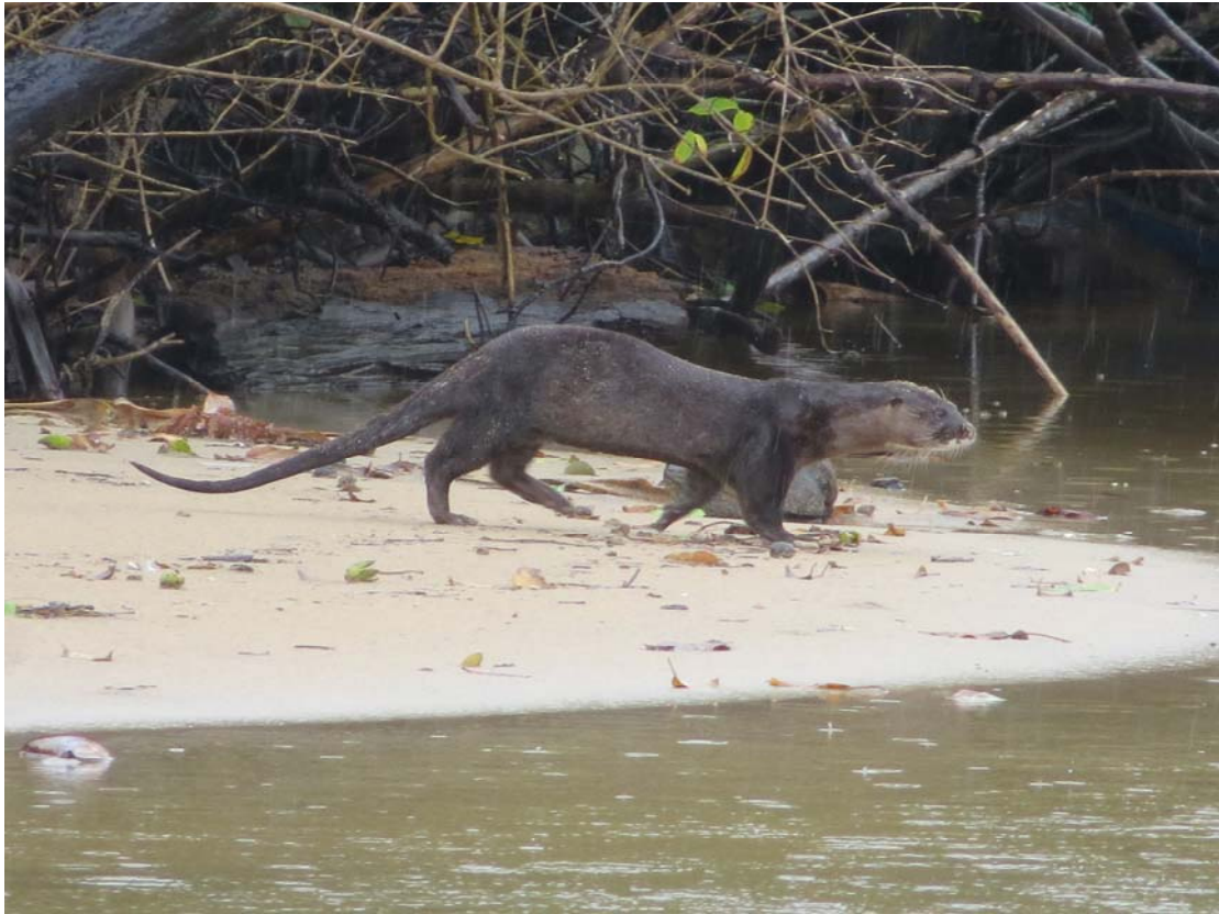
Figure 2. Lutra sumatrana in the Cukuh Babui estuary, Tambling Wildlife Nature Conservation, Bukit Barisan Selatan NP. The otter's characteristic hairy rhinarium and striking white patches on lower lip seen here clearly distinguish the animal from Lutra lutra .

The firm sand did not yield good prints, but one impression of a forepaw had a width of 57mm and a length of 59mm (Figure 3). Only four toes were visible. The largest toe had a width of 10mm and the pad with was 21mm. In the fairly symmetrical print the claws were distinct but the interdigital webbing was not visible. Kanchanasaka (2001) reported average forepaw track widths of 58mm from a sample of 23 observations.