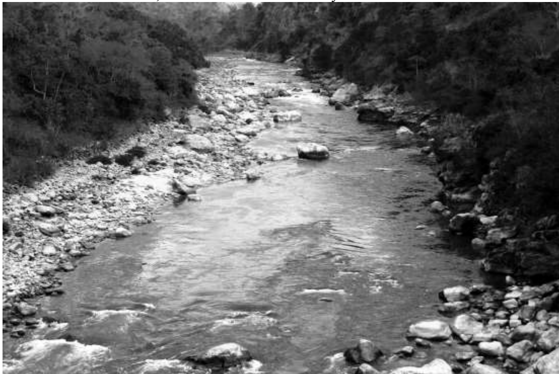
Figure 2. The high-energy Punatsangchhu/Sunkosh River drains a large portion of the high Himalaya, and flows on a steep north-south gradient through narrow valleys.

Forest cover was dominated by temperate broadleaf forest along the upper portion of the study area, dry Chir pine ( Pinus roxburghii ) forests along the middle portion, and subtropical broadleaf vegetation in the lowest portion (Figure 2,3). Annual precipitation varies from 400 to 600 mm in the upstream section, 700 to 900 mm for the midstream region and more than 2000 mm in the southernmost region (Choden, 2009). No transects were located close to the two hydroelectric facilities and dam under construction, where the river is currently diverted from its channel.