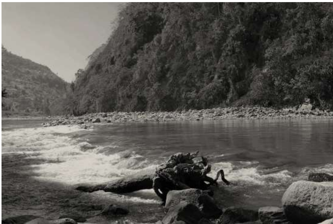
Figure 3. Lower gradients in the southern reaches of the Punatsangchhu/Sunkosh River slow and broaden the flow, providing more sandy beaches.