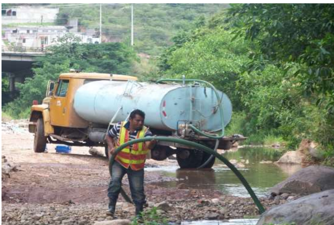
Figure 3. Extraction by local people for water supply.

On June 12, 2014 we conducted field surveys to locate tracks, scats at latrines, and dens to determine if a population of Neotropical river otters was well established in the area where the carcass was collected. We also conducted interviews of residents to determine if they could provide evidence of the species occupying the area. During surveys we located 37 scats among five latrines, which were found on rocks jutting out of the river, over a total of 130m of the same stretch of the river. The spraints were distanced between 15 m - 20 m. The largest number of scats found at one place was seven and the lowest was three; the size of scats averaged 8 cm (Figure 4). The