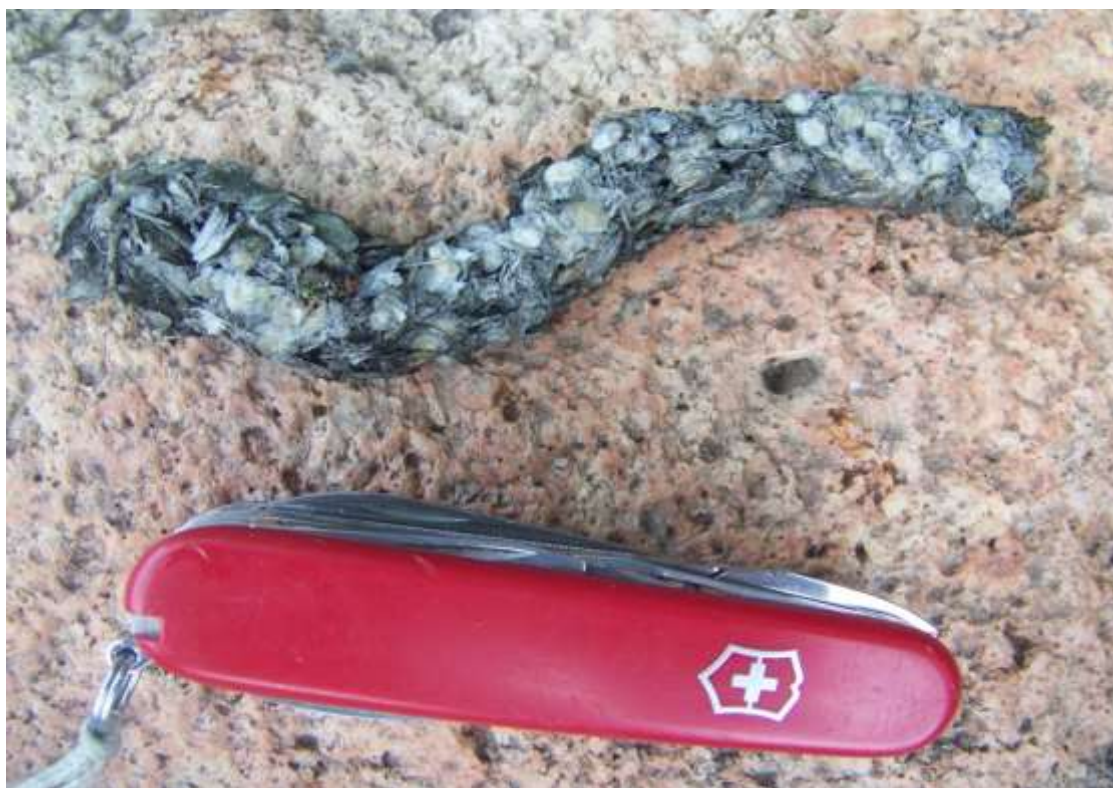
Figure 4. Scats of L. longicaudis in the Choluteca River, Honduras.

scats were mostly dry and were identified according to the description provided by Aranda (2000), with most being composed of bones and fish scales. No dens were located; however, on the banks of the river there are tree roots that have cavities that could be used as dens: Pardini and Trajano (1999) found that caves under tree roots were one of the most used shelters by Lontra longicaudis in southern Brazil.