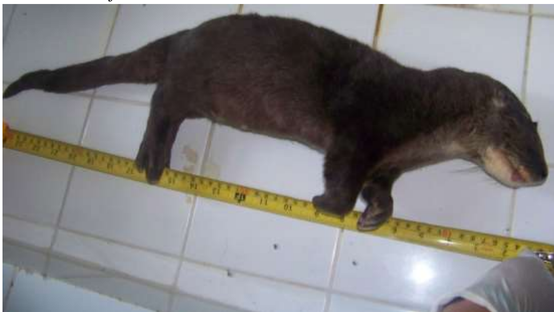
Figure 2. Handling of the Neotropical otter for size and weight measurements.

activities such as roads for livestock and laundry by local communities. Despite human influence, riparian vegetation structure is still present, and the river contains rocks located adjacent to its banks.