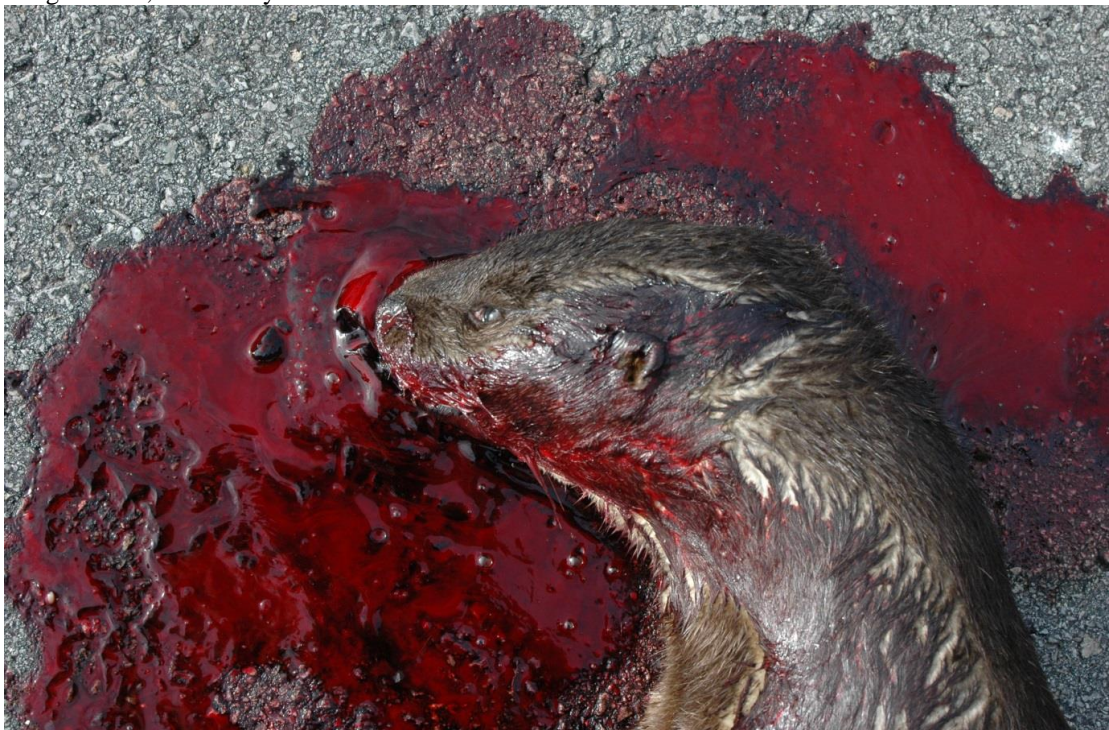
Figure 3. Close-up of head region of Lutra sumatrana fresh road kill, possible female ca. 1.2 m length, on road Tanjung Malim-Sungei Besar, 5 th January 2005.