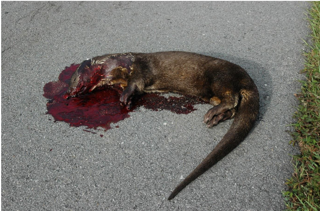
Figure 2. Lutra sumatrana fresh road kill, possible female ca. 1.2 m length, on road Tanjung Malim-Sungei Besar, 5 th January 2005.