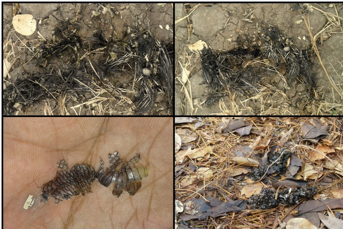
Figure 4. Spraints of smooth-coated otter found at Gavier Lake in November 2015

Surveyed other water bodies of Surat outskirts of Surat such as lakes, wetland, canals and mangroves areas revealed evidences of smooth-coated otters at seven sites (Tab.1).