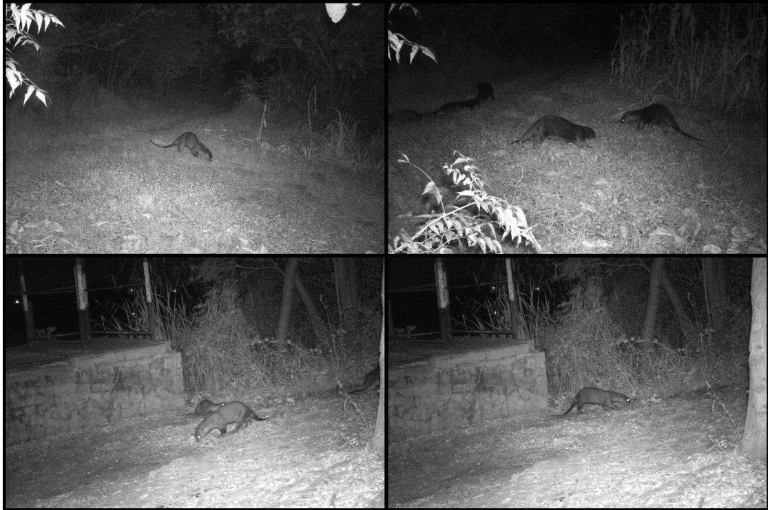
Figure 2. Smooth-coated otters documented by camera trap at Gavier Lake during November 2015

On the first day after setting a camera trap recorded a group of five smooth-coated otters (Fig. 2). Later camera trapping was continued for more than a month for documentation and photographs and videos were collected.