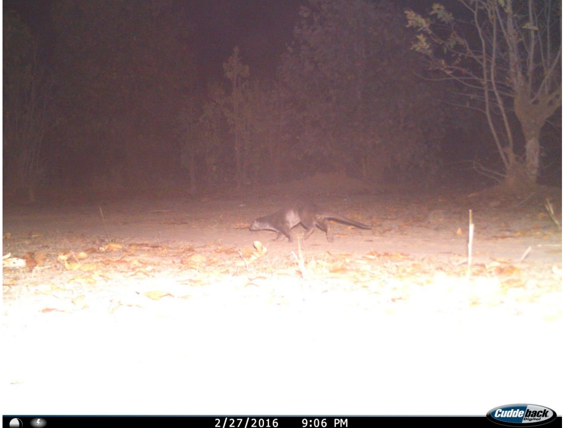
Figure 2. The camera trap image of the smooth-coated otter in BTR

The smooth coated otter was first recorded in a camera trap on February 27, 2016 (Figure 2). The camera traps were installed along the roads and trails. The species was captured in one of the camera traps (Figure 1) set along the road. The trap location exists near a perennial stream that originates from the Bandhavgarh Fort, locally known as Charan Ganga . The stream flows through the forested area and finally makes its way into the villages. The locals use the stream for irrigation, fishing and washing purposes. Jamun ( Syzygium cumini ) and sal ( Shorea robusta ) are the dominant vegetation forms along the stream and provide suitable habitat for other large carnivores during summers.