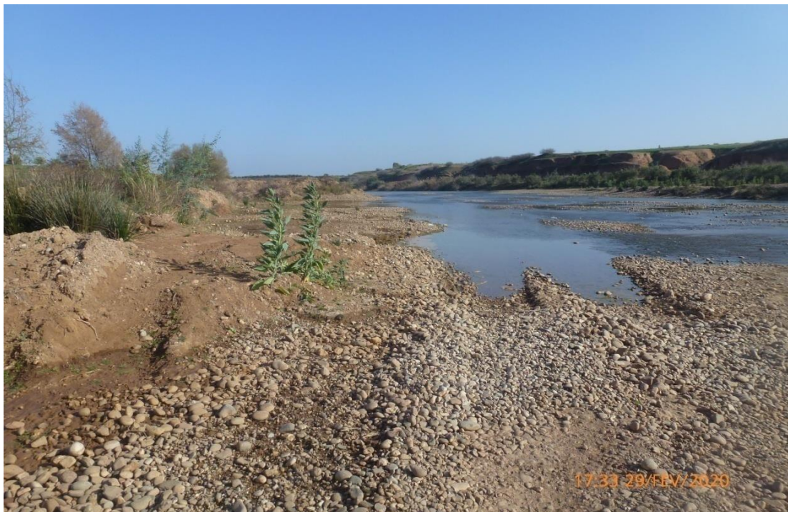
Figure 6. Picture showing the destruction of Lutra lutra habitat in the Middle Oum Er Rbia River at Lemrabta region.