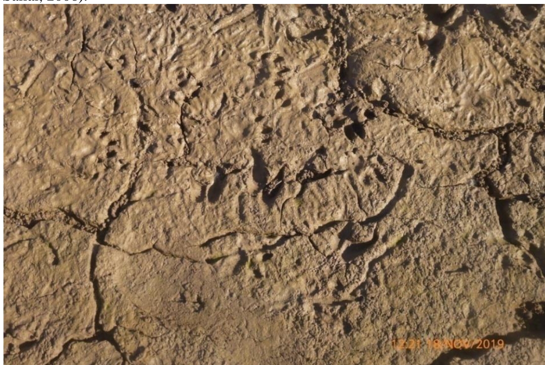
Figure 2. Footprints of Lutra lutra found in the Middle Oum Er Rbia River, west of the village of Sidi Aissa Ben Ali (site 2, Fig. 1) (November 2019).

Results of the surveys confirmed the presence of Lutra lutra in two sites: in 'La Chutte' (site 2, Fig.1) and in the south west of the village of Lamrabta (Site3, Fig. 1). In Ouled Jbir (site 1, Fig. 1), although 11 local inhabitants confirmed the observation of an otter's cadaver near this village in 2019, we did not find any sign of the actual presence of otters. In the sites 2 and 3, we found spraints (Fig. 2, Fig. 3) and footprints of otters (Fig. 4). According to inhabitants who frequent the river at night, at least 7 otters were observed in site 2, and 5 otters in site 3. In the south west of the village of Lamrabta (site 3, Fig. 1), we found cadavers of two juvenile otters (Fig. 5). Results of the interviews showed that the two dead otters were not killed by inhabitants. The majority of the interviewees who frequent permanently the river confirmed that they find cadavers of dead otters in the river during the last two years. Observation of the scats found showed the presence of scales and fish bones with a dominance of the shells of freshwater gastropods, namely the subclass of Prosobranchs and other taxa of Gastropods. The presence of these preys in the otter's diet has been already confirmed by several studies (Mason and Macdonald, 1986, 1993; Lanszki and Kormendi, 1996; Kingston et al., 1999; Lanszki and Molnar, 2003; Lanszki and Sallai, 2006).