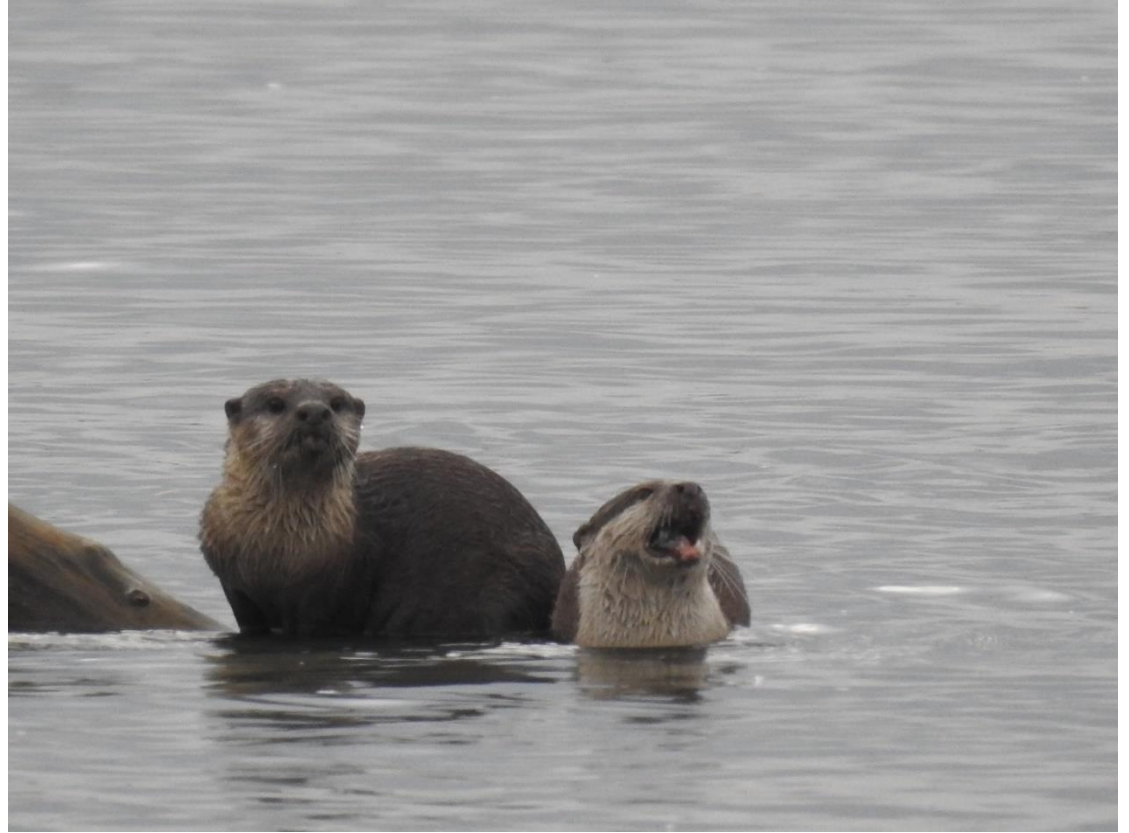
Figure 3: A pair of Asian Small-clawed Otters Aonyx cinereus seen in the Jia-Bhoroli River at Nameri National Park, Assam.