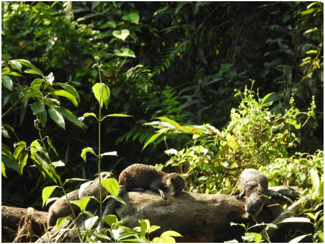
Figure 2: Three Asian Small-clawed Otters Aonyx cinereus seen on a fallen log at Muniram Beel, Nameri National Park, Assam.

for otters to feed there. We also observed fallen logs in the water in around the beel which may be preferred by the otters. There is an anti-poaching camp close to the site and therefore experiences low levels of human disturbance at the pond. It is a relatively undisturbed location and if maintained, could be of regular, long-term importance to Asian Small-clawed Otters in the forest.