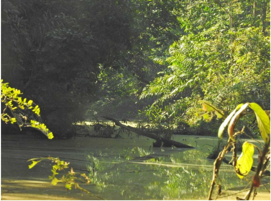
Figure 4: A photograph to show the habitat occupied by the Asian Small-clawed Otters at Rangamati Beel in Dehing-Patkai Wildlife Sanctuary, Assam.

On the 09 December 2018 at approximately 08h00, we observed a lone Asian Small-clawed Otter in a small stream at the Digboi Oilfields in the district of Tinsukia, Assam (27° 20'N, 95° 29'E). The stream is located right opposite a boiler unit which consists of a large reservoir inside Digboi Oilfields. Excess water from the reservoir flows into this particular stream. The two are separated by a road and the water flows below the road through a canal and joins the stream. The otter was seen for a few seconds swimming near the roots of a tree growing at the edge of the stream. It could not be photographed but it sensed our presence before swimming away and hiding. This location was very close to the boiler unit and is one of the busier roads in the area. We later left the stream to continue our work and when we returned, we saw over ten fishermen at the stream, diverting the water by moving the rocks and catching fish with traps. Some fishermen were at the opening of the possible tree den and the part of the stream where the otter was seen was now turbid because of the water diversion and movement of fishermen. We later informed the Forest Department of these observations. There are several forested streams in the area and we requested more monitoring of this stream in particular since otter presence was confirmed. We also suggested some signage on the road to warn against illegal fishing.