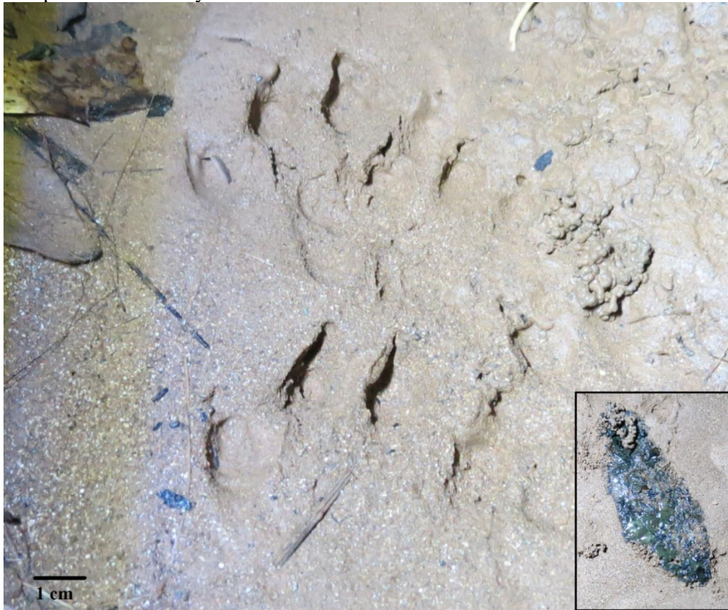
Figure 2. Footprints and mucus (insert) of Lontra longicaudis recorded in Ribeirão da Mata creek affluent, Lagoa Santa municipality, Minas Gerais state, southeastern Brazil.

(Lund, 1842), intensive searches will be conducted to better determine if the species still persists in such system.