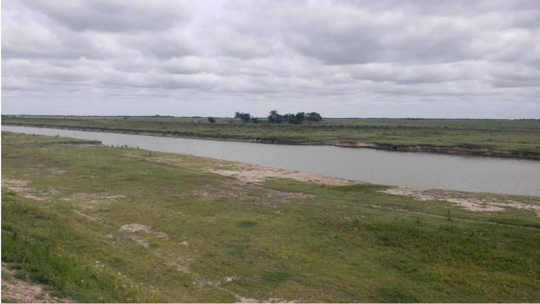
Figure 2. Representative picture of Buenos Aires province landscape where a giant otter male was recorded in December 2021 by a farmer.

The second individual was recorded in Iberá Park (IP), Corrientes province. This park, a complex of protected areas including the Iberá National Park and the Iberá Provincial Park (both IUCN Category II), encompasses 756,000 ha (Fig. 1) and conserves an extensive wetland characterized by swamps, bogs, lagoons, streams, grasslands, and patches of forests (Fig. 3). This location lies inside the known historic distribution of the species (Beccaceci and Waller, 2000), although giant otters vanished from Corrientes more than 30 years ago (Beccaceci et al., 1995).