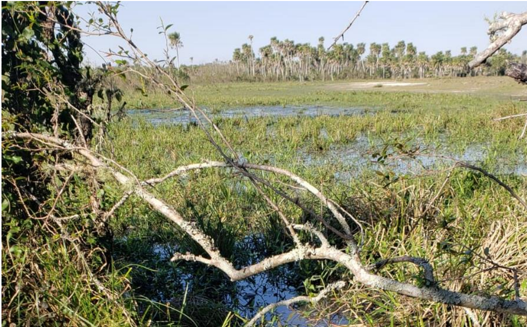
Figure 3. Representative picture of the Iberá Park landscape where a solitary giant otter of unknown sex was recorded by a camera trap in September 2022.

The second individual was recorded in Iberá Park (IP), Corrientes province. This park, a complex of protected areas including the Iberá National Park and the Iberá Provincial Park (both IUCN Category II), encompasses 756,000 ha (Fig. 1) and conserves an extensive wetland characterized by swamps, bogs, lagoons, streams, grasslands, and patches of forests (Fig. 3). This location lies inside the known historic distribution of the species (Beccaceci and Waller, 2000), although giant otters vanished from Corrientes more than 30 years ago (Beccaceci et al., 1995).