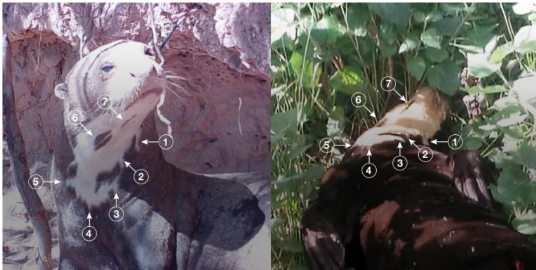
Figure 4. Photographic records presenting the throat pattern of the solitary giant otter male registered by: (left) a camera trap in the El Impenetrable National Park; and (right) by a stream in the Villa Roch locality, Buenos Aires province (right), Argentina. The arrows show the similarity of the shape of the white patch on the throat of both records.

Subsequent analysis of the otter's throat marks revealed that they were identical to those observed in the solitary male spotted in May 2021 at EINP and surrounding area (Fig. 4). In November 21 st , 2021 fresh signs were observed for the last time in the EINP area (eg. tracks, scats), but we didn't get any photographic record of the animal. If these signs observed in November, 2021 at EINP correspond to the same solitary male observed in December, 2021 in Villa Roch, then this individual must have travelled over 2000 km, along the Bermejo, Paraná and La Plata rivers and artificial Canal Number 1, in only 10 days. Previous photographic records of this individual, after its first sighting in May 2021 at EINP, suggest that the maximum distance that it may have traveled was 200 km in, at most, 2 days.