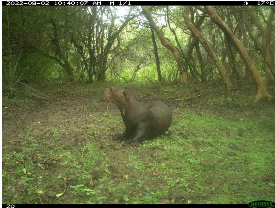
Figure 5. Photographic record of a solitary giant otter by camera trap located in the Iberá Park, Corrientes Province, Argentina.