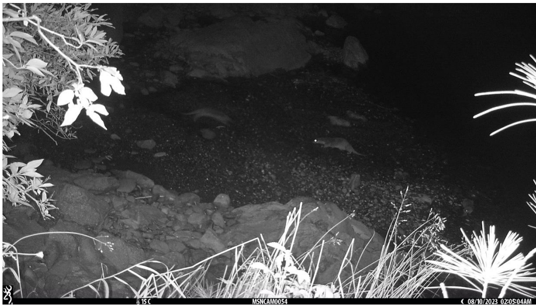
Figure 2. Eurasian otter camera trap record from Kishanganga river Gurez Valley.