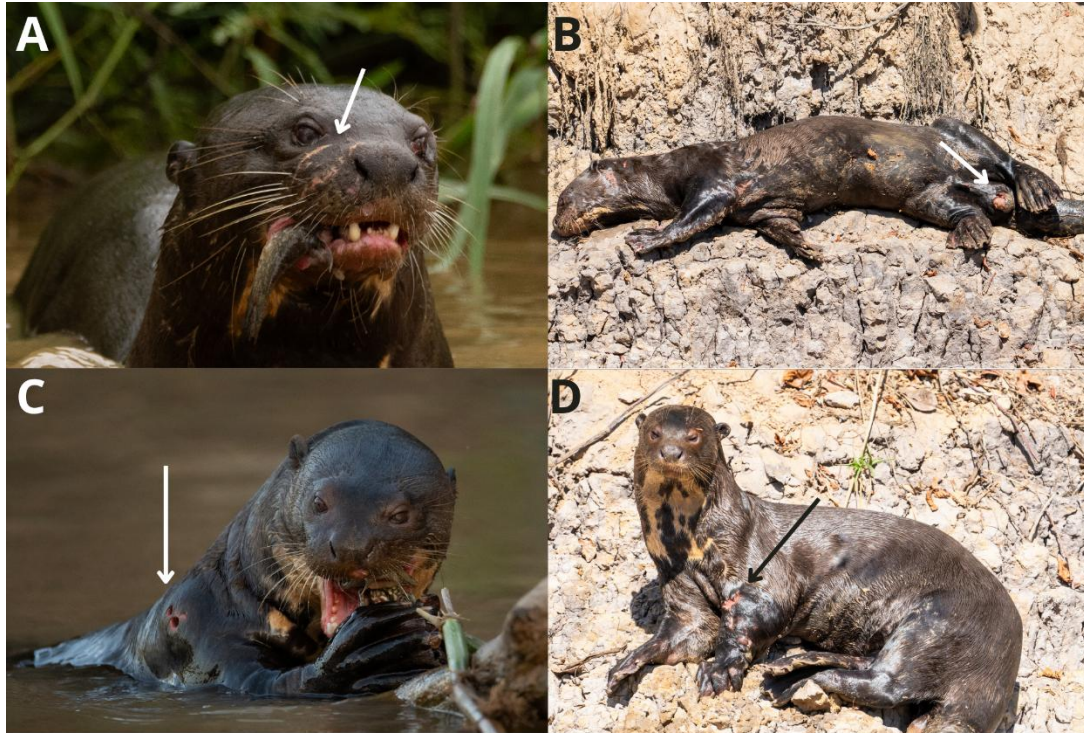
Figure 2. Injuries reported for a group of giant otters after an agonistic encounter on July 11th 2023, in the Brazilian Northern Pantanal. A: The dominant male “Pai” presents wounds with irregular lacerations on the right side of the face below the eye, extending to the mouth (photo: Gustavo Gaspari). B: The scrotal sac of “Pai” exhibited a lacerating injury, exposing the testicle (photo: Fabio Arruda/Barong House). C: The dominant female “Petri” had a wound on her right limb (photo: Fabio Arruda/Barong House); and D: The subordinate male “A” had injuries on his left front paw (photo: Fabio Arruda/Barong House).

On August 11th, hypertrophic scar tissue, with irregular hairless edges was seen on the animal's head, along with complete healing of primary lesions. The same scar pattern could be seen on the paws while holding a fish (Fig. 1G). Nevertheless, the main area affected by myiasis infestation on the back showed a rapid increase in size, with more larvae, hypopigmentation, and significant loss of tissue structure (Fig 1H).