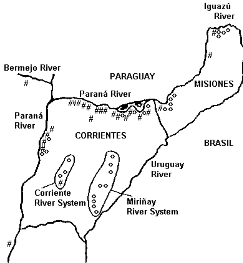
Figure 2. Distribution of local sightings of familiar groups (#) and lone animals or pairs (o).

Since 1989 field surveys have been carried out to determine possible presence in areas from : which the otter was previously recorded. Searches along rivers were conducted and local people, particularly hunters, fishermen and boatmen, were questioned. The searches revealed very little information, but from the enquiries 53 records of occurrence of the giant otter were compiled (Figure 2).